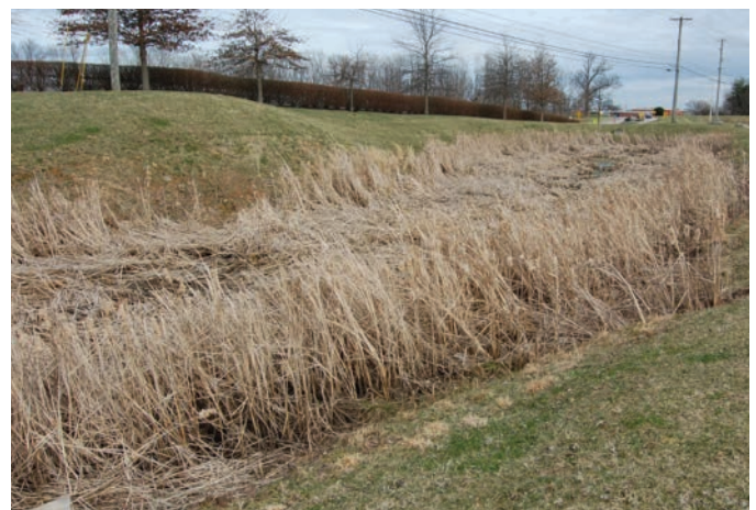
Cattail, an invasive plant species, is covering the entire surface area of this retention basin.