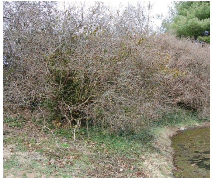
Japanese bush honeysuckle, an invasive plant species, is invading this embankment.