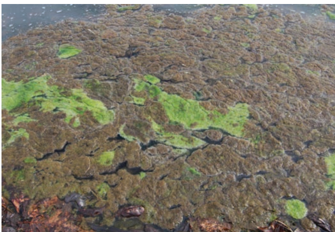
Algal growth is caused by excess nutrients.