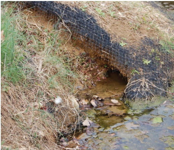
A muskrat has created a hole in the turf reinforcement mat and a tunnel into the bank, destabilizing the embankment.